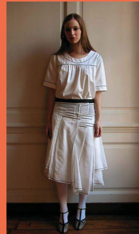
14. After Midnight Collection