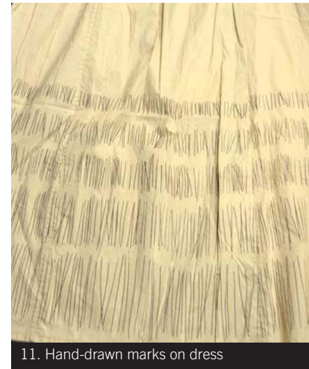
11. Hand-drawn marks on dress

There's a dress of Mum's that Mum made for herself in the Seventies, it became basically my life. A long wrap patchwork dress. It's travelled with me. But it became my identity in a way, because all the things of me being patchwork queen are also being very referenced, I reference myself very much – that era is my childhood.