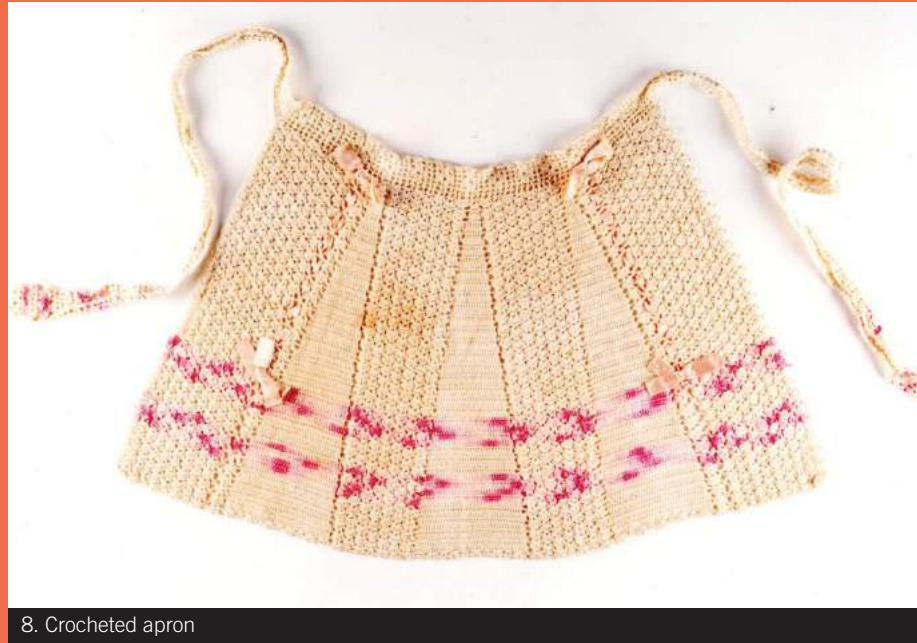
8. Crocheted apron

My family history is intriguing to me. The fact that my grandmother did batik, and her genes, you know, were passed on. Mum's absolute support and belief in arts being sustainable.