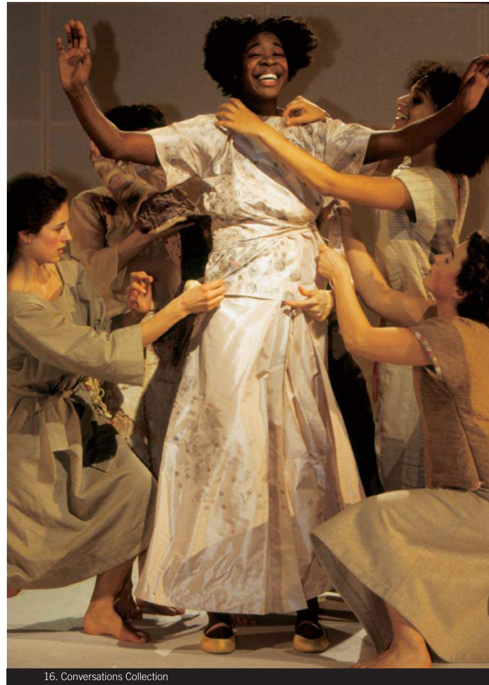
16. Conversations Collection

When, I left NoLogo, I thought what would happen if I chose fabric rather than fabric being given to me. By choosing a group of pure white, a group of pure black fabrics, and then I built something which was very textural, which you can read like the kind of sculpture I wanted to do when I was younger. From that exercise I can create fabric. I mean, I wasn't weaving, but the embellishment, all the printing was in-house.