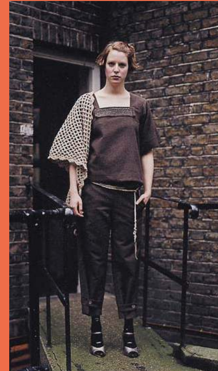
13. Whisper Collection