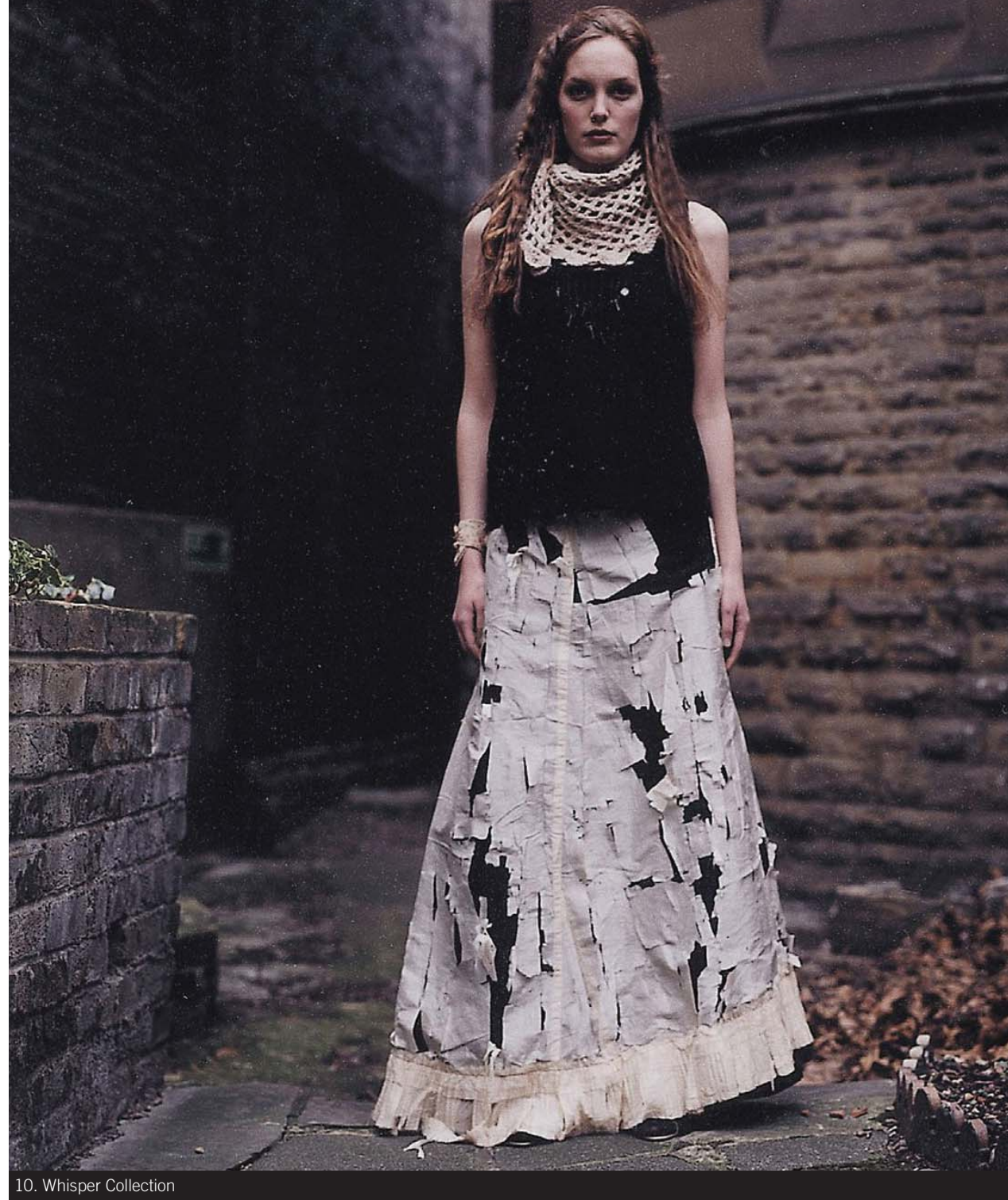
10. Whisper Collection

You have to make that first stitch. That propels you. When you look at a piece that's been darned, you know that that's somebody's time. Those stitches hold that time. What you can get from that simple magic, it's not so simple because it is magic, is a whole identity. You literally can make an identity, which is something incredible, and I think that's the empowerment.