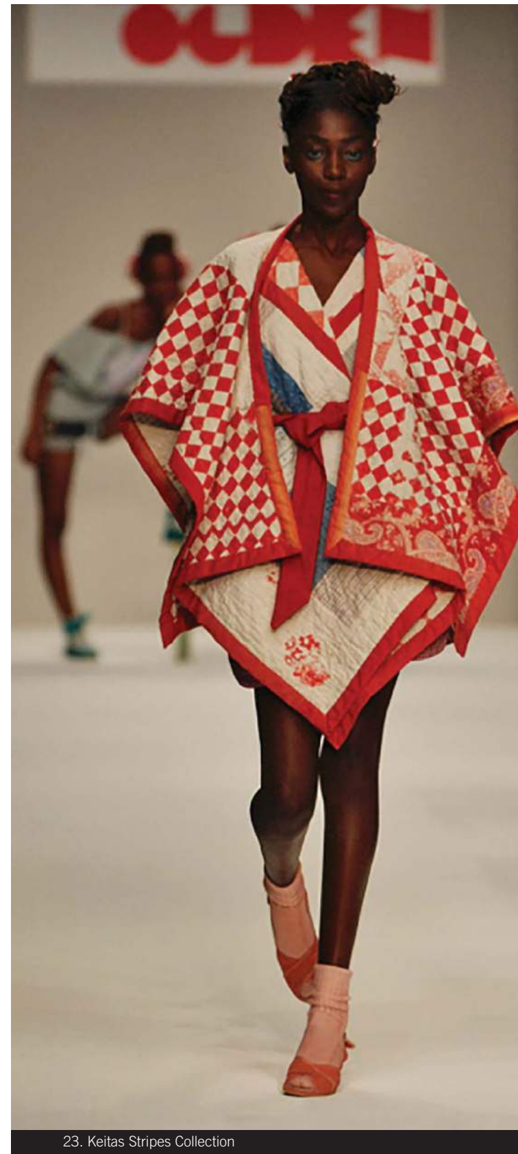
23. Keitas Stripes Collection