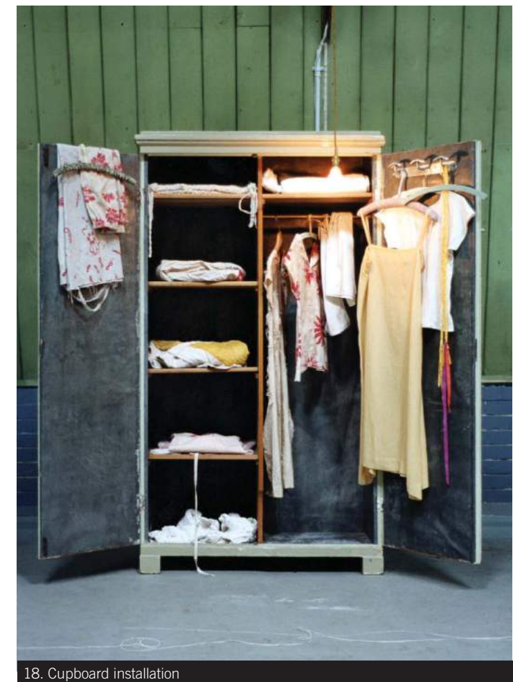
18. Cupboard installation