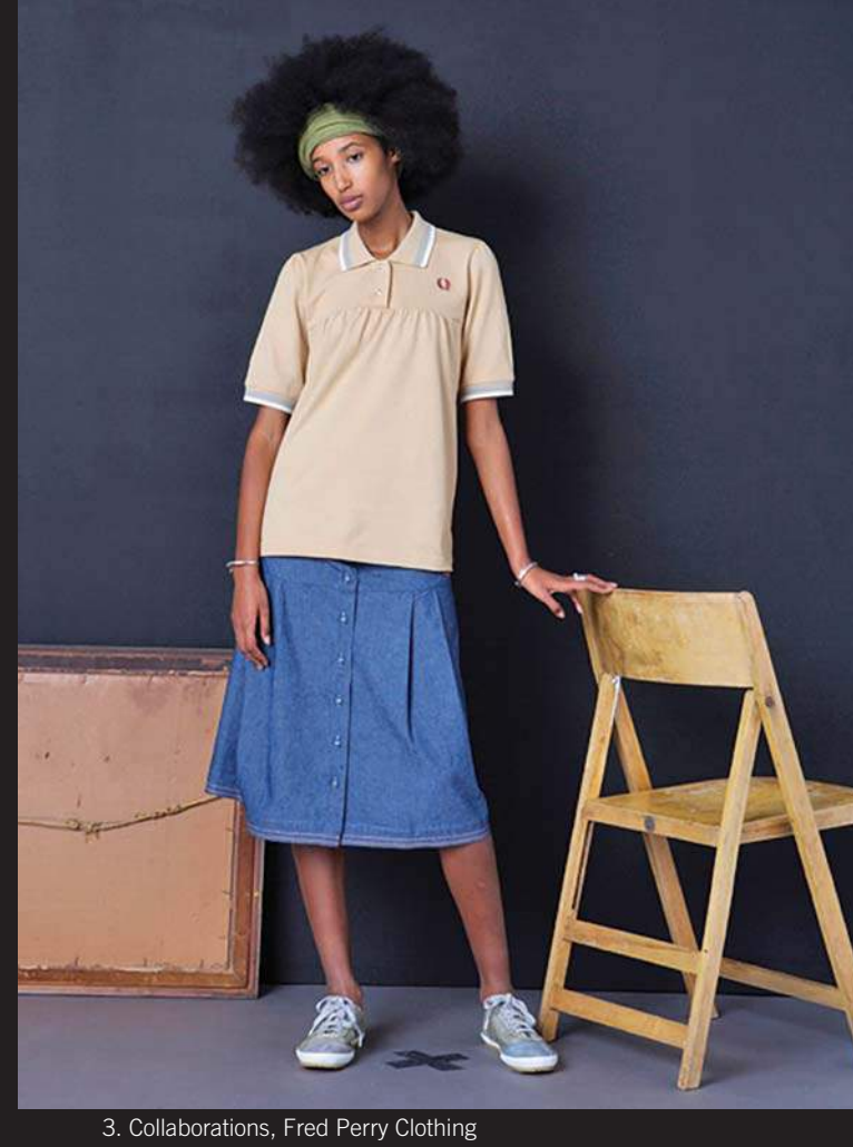
3. Collaborations, Fred Perry Clothing