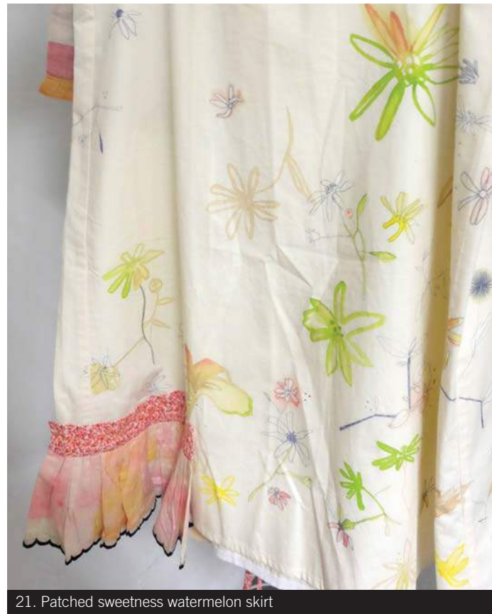
21. Patched sweetness watermelon skirt

A.P.C. would send a box of old stock; our studio would customise it, and it would be sent back. That's how, one of the ways the relationship with APC started, and it went on for about two years.