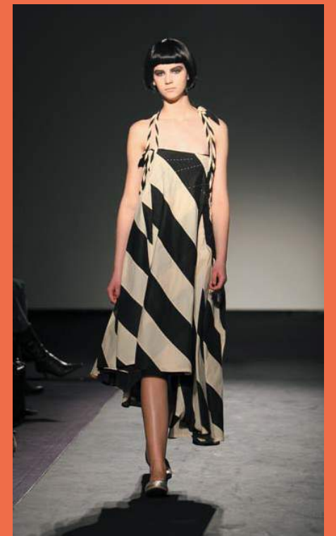
15. Annabella Collection

The exercise did with my friends was the spark.