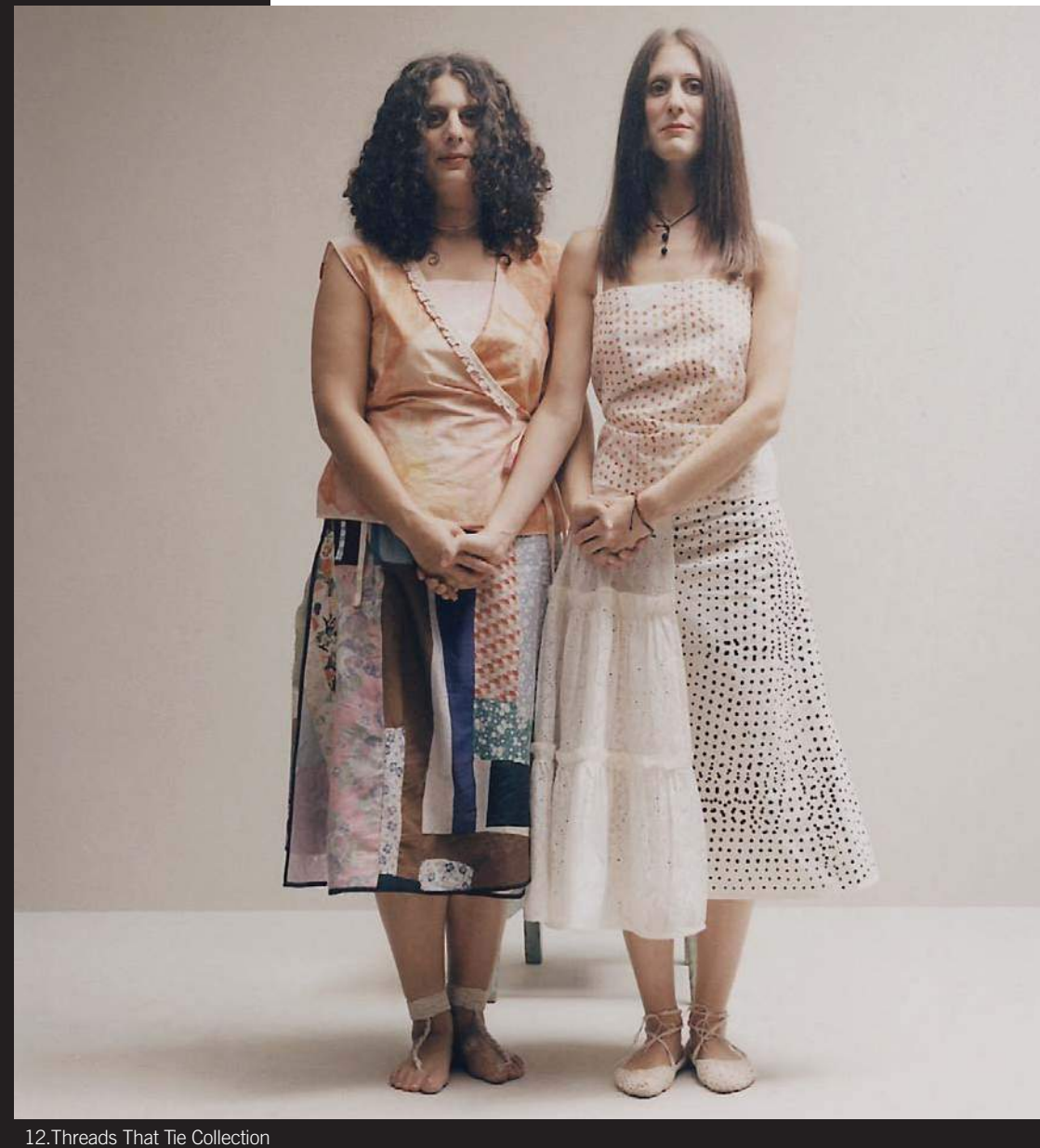
12. Threads That Tie Collection

And there's some I've lost. I did a show in London, it was surrounding death. I used a small photograph which had a silver frame, very rough, of my father and I. That is lost. But I still have the piece I made from it, which was a cushion with the date of his death embroidered on it. But I do have a real thing now, it's not lost in a way, the memory is as strong as having it.