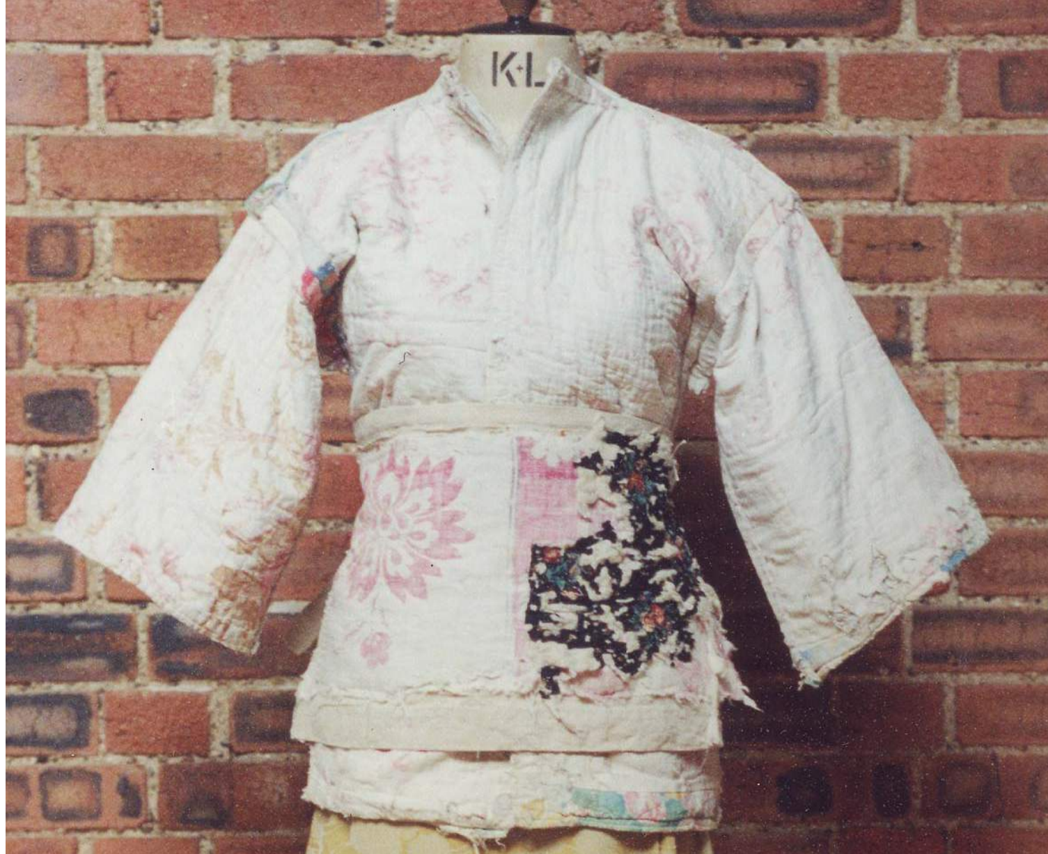
19. Re-use fabric Kimono

Finding an antique quilt, and being inspired by it, knowing it's had a life before, it's going to go through this life with you, and, it will have a whole other life going on afterwards in a new form.